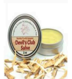
Devils Club Salve